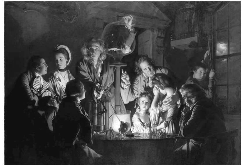
An Experiment on a Bird in the Air Pump , by Joseph Wright. (National Gallery, London.)

The adult facing us in the painting is a traveling science lecturer, if you will, a circuit rider of the new religion, demonstrating a vacuum pump to the rapt onlookers. He is pumping the air out of a glass cage, and to make that fact visible there is a bird inside the cage. By watching the bird gasp for breath, in other words, they can see that there’s no more air in the cage, and be impressed with what technology can do. But what other impression are we to receive? The real dramatic interest in the painting, what grabs our eyes and holds them, is the children. For them this is not about the wonders of science. In their innocence they do not follow the explanation of the pump and the air; they just think a man is killing a little bird. The real story of the painting is in the contrast between the glazed lecturer holding the audience spellbound, a kind of high priest of technology, and the distress of the children—and the fact that they are children, and the adults just ignore them. When we hurt nature, it is not that we lack warnings. Not all of us lose our sensitivity at once. The real tragedy is to ignore those who are still aware of what we’re doing—the way, in the Iliad , Hector and his wife, Andromache, laugh at their little son,