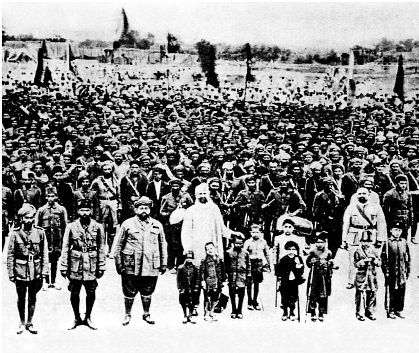
An army without arms. Abdul Ghaffar Khan at the first meeting of the Khudai Khidmatgars, April 1930

courageous than the Hindus. That is why the Pathans were able to remain nonviolent.” 10