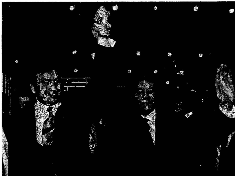
Opposite: Voters in the former Soviet Republic of Georgia go to the polls to elect a new president to replace Eduard Shevardnadze in what became known as the "Rose Revolution." Above: Ukrainian president Viktor Yushchenko arrives at the European Council in Strasbourg with Georgian President Mikhail Saakashvili.

The similarities among these civilian-based transitions