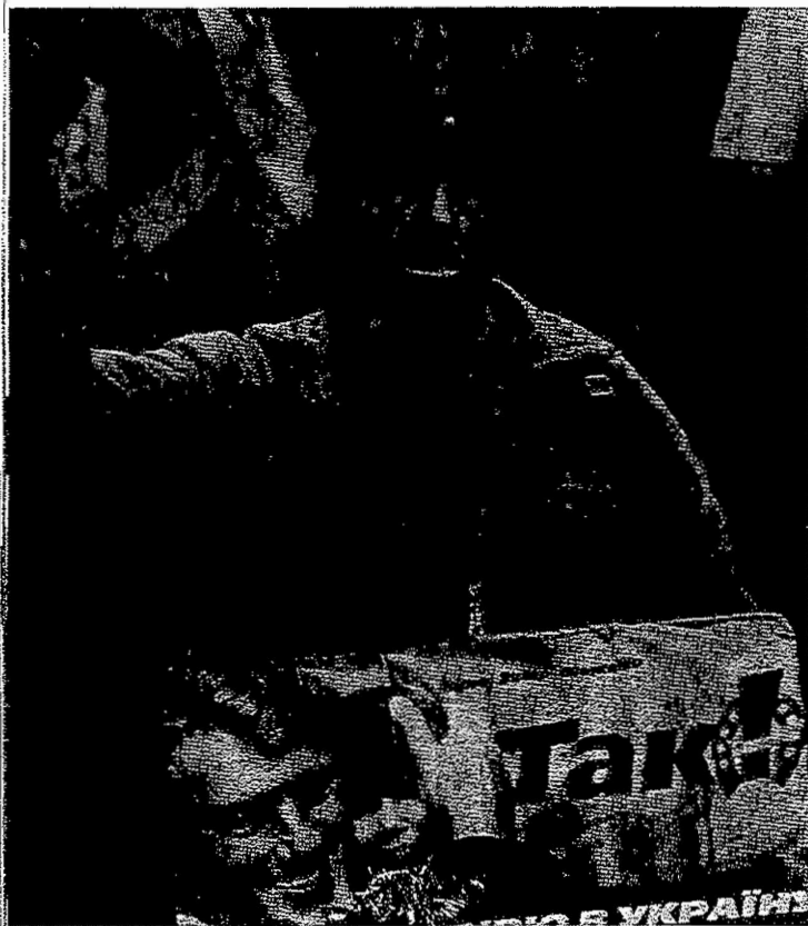
A Ukrainian resident waves orange ribbon at a religious procession in downtown Kiev to support the Ukrainian opposition led by Viktor Yushchenko.

The tens of thousands of civilians who make people power work become the cadres of politically active citizens who make democracy work. That is a major reason why such states tend to remain democratic long after the change. Freedom House noted that the stronger the nonviolent civic coalition operating in societies in the years immediately preceding the transition, the deeper their transformation in the direction of freedom and democracy. This correlation—between indigenous civilian-based resistance and the sustainability of democratic rule—should reframe the debate about how the international community or any government should encourage democratization.